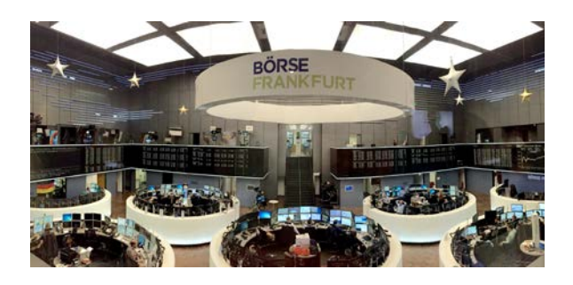
The Frankfurt Stock Exchange.

Locating and extracting geological resources are vital to Europe's GDP, tax revenues and economic growth. The use of raw materials for industrial and consumer products and processes, and of fossil fuels for energy, underpin our prosperity and are major contributors to the economy in their own right. The extraction of oil, gas, coal and construction and industrial minerals makes up a significant part of the GDP of European nations - in the UK in 2011, this amounted to £38 billion, or 12% of nonservice GDP – with the industries dependent on these resources contributing even more. North Sea oil and gas is a major contributor to several European national economies, and generates billions of euros in tax revenues each year. The market capitalisation of extractive industry companies on European stock exchanges in 2012 was more than €2.3 trillion.