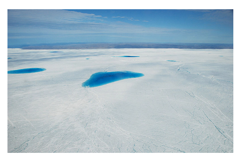
Melting at the perimeter of an ice sheet in Greenland.

Evidence of past climate change is preserved in a wide range of geological settings, including marine and lake sediments, ice sheets, fossil corals, stalagmites and fossil tree rings. Advances in field observation, laboratory techniques and numerical modelling allow geologists to show, with increasing confidence, how and why climate has changed in the past. This baseline of knowledge about the past provides an essential context for estimating likely changes in the future.