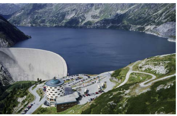
Wastewater treatment system and Kölnbrein Dam and pumped-storage power system, Carinthia, Austria.