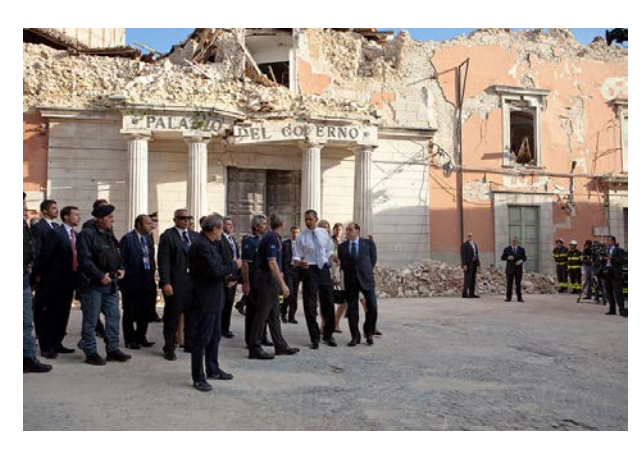
President Barack Obama visiting earthquake damage in L'Aquila, Italy.

Probabilistic forecasting of the likelihood of earthquakes happening in a particular area over a period of time has improved greatly in recent decades as a result of geological research. However, it is not currently possible to make deterministic predictions of exactly when and where earthquakes will happen, and most geologists do not believe this to be a realistic prospect. Mapping the risk of earthquakes and modelling their effects are essential to improving preparedness and resilience. The SHARE project (Seismic Hazard Harmonization in Europe) has established common data standards and methodologies, and will support the development of shared standards for mitigating the effects of earthquakes.