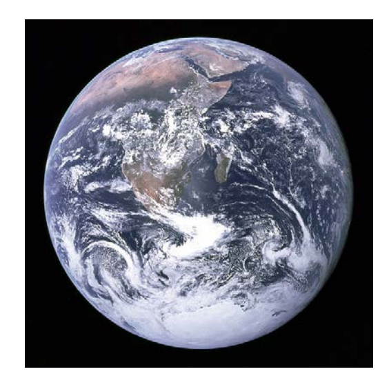
Image of the Earth taken by the crew of Apollo 17.

Geology is the study of the Earth's structure and history. It underpins the provision of resources to Europe's population and industry, delivers a wide range of essential services, and helps us understand how we can live more sustainably on our planet, thanks to our strong skills base, education and research.