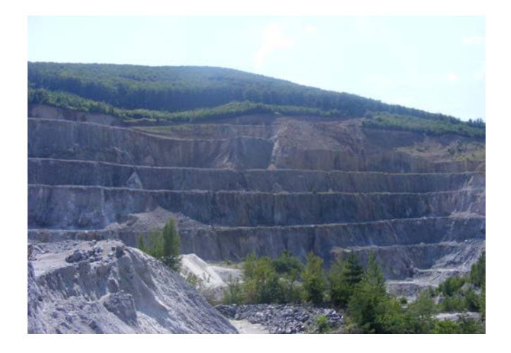
Perlite mine, Pálháza, Northern Hungary.

In the nineteenth century, the growth of large European national economies was driven by extraction and use of coal, metal ores and other raw materials. Europe is no longer the dominant producer of most minerals, but its rich and varied geology means that many of its nations continue to be significant producers and exporters of particular commodities – for example, silver in Poland and titanium in Norway – as well as construction materials and some large-scale industrial minerals such as salt.