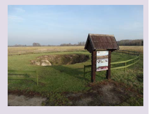
Karst sinkhole in the Biržai district, Lithuania.

Other less dramatic hazards include the swelling and shrinking of clay formations, which can damage buildings and infrastructure, sinkhole formation by the dissolution of more soluble rocks, and the presence of weak and compressible ground. Although such 'quiet hazards' rarely cause loss of life, their economic impact can be significant.