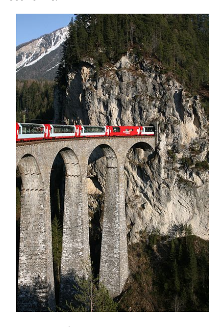
Glacier Express on the Landwasser Viaduct, Switzerland.

As we turn to the geosphere to provide an ever-greater variety of services, these need to be carefully planned. Any given volume of the ground may be required to perform several different functions, consecutively or concurrently. There may sometimes be competition for underground space between functions which are not readily compatible. Geologists can advise on these matters, but decisions about how we use the geosphere are ultimately political and economic.