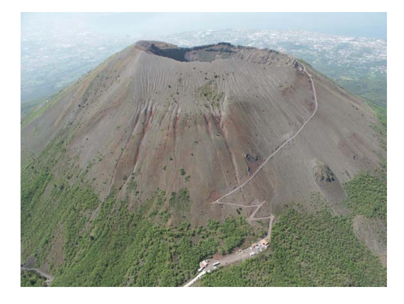
Mt Vesuvius, Naples, Italy.

An estimated 500 million people globally live close enough to active volcanoes to be affected when they erupt. Many cities have developed on the fertile land often found in the vicinity of volcanoes. Active volcanoes