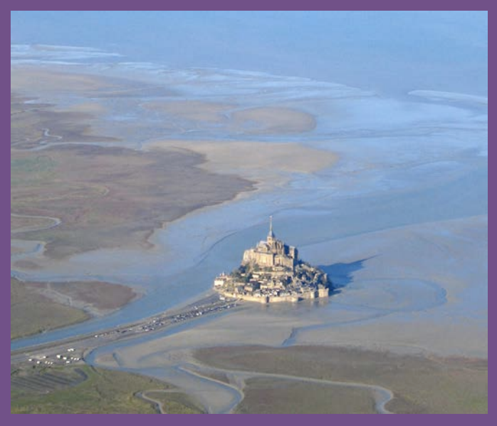
UNESCO World Heritage Site Mont Saint-Michel Island and its bay in Normandy, France, listed for its cultural heritage in addition to its natural-beauty.

Sediments are transported in and out of estuaries by the tides and currents, carrying with them pollutants, and interacting with seawater chemistry. Fishing can cause disturbance to the sea floor, disrupting ecosystems. The construction of coastal defences can change current patterns and resultant sediment distribution. Nutrient cycling as a supporting service is dependent on geochemical interactions between various components of the marine/fluvial system – the bedrock, superficial sediments, biota, the water column and the atmosphere.