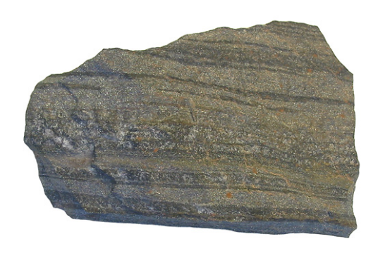
Sample of banded iron formation from Krivoy Rog,

and the impacts of extracting and using them more keenly felt. An increasing global population rightly expects greater prosperity and more equitable access to resources, putting additional pressure in particular on the already stressed water-energy-food nexus. The challenge of secure and sustainable supply of water and energy is exacerbated by climate change. Increased stress to their supply will have significant repercussions both for domestic supply and for energy- and water-intensive industries such as mining and construction.