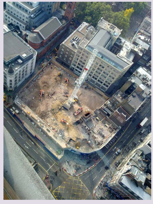
The Tottenham Court Road Crossrail construction site.

An ever-growing proportion of the world's population lives in increasingly large and complex cities. The work of geologists in managing multiple concurrent (and sometimes competing) uses of the surface and subsurface will be particularly important in urban areas if the cities of the future are to be sustainable.