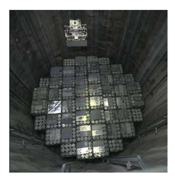
Low and intermediate level waste at the Olkiluoto repository, Finland.

Fossil fuels will continue to make up an important part of Europe's energy mix over the next few decades at least. Some nations have reaped enormous benefits from North Sea oil and gas in recent decades. Significant offshore resources remain – their successful extraction depends on continuing to develop our geological understanding and extractive technologies. We are also starting to understand better the extent of onshore resources of unconventional fossil fuels, such as shale gas, shale oil and coal bed methane, which have the potential to make a significant contribution to our energy mix if we choose to extract them. Countries which do not develop their domestic fossil fuel resources will become more dependent on imported fuel, which may adversely affect their energy security. Much of Europe's electricity is still generated from burning coal.