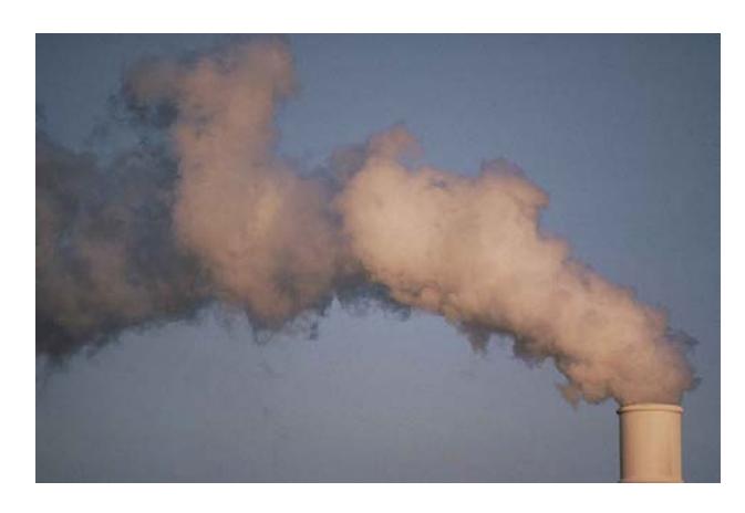
Air Pollution: Smoke rising from a plant tower.

The British Geological Survey is currently undertaking work to investigate the Many researchers are currently undertaking work to investigate the range, type, scale and magnitude of anthropogenic influences on land use and Earth system processes, their impacts and their geological